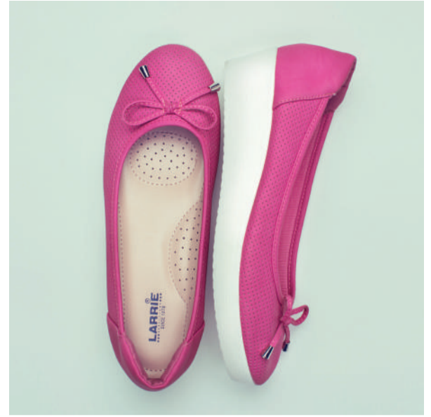
PRODUCT CODE_ L21424-WS01SV | COLOUR_FUCHSIA