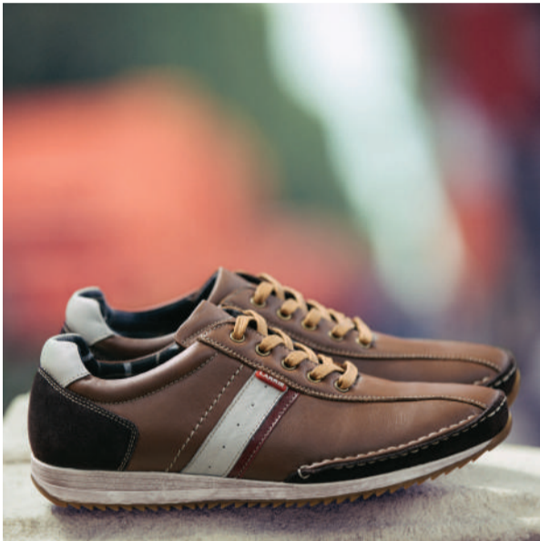
PRODUCT CODE_ 551601-BS2SV-32 | COLOUR_DARK BROWN