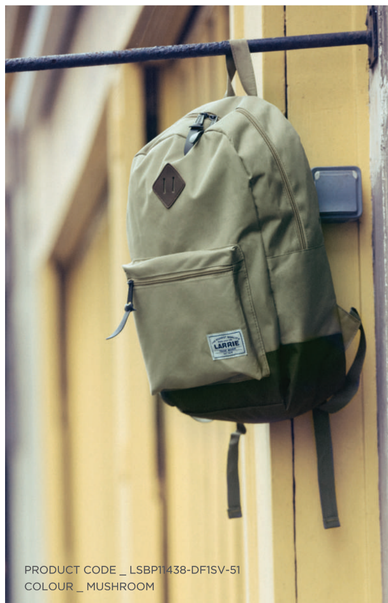
PRODUCT CODE _ LSBP11438-DF1SV-51 COLOUR _ MUSHROOM