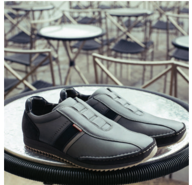
PRODUCT CODE_ 551601-BS1SV-12 | COLOUR_GREY