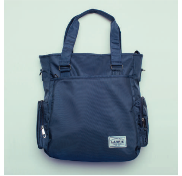
PRODUCT CODE_ LSTB11422-DFISV-43 | COLOUR_ NAVY