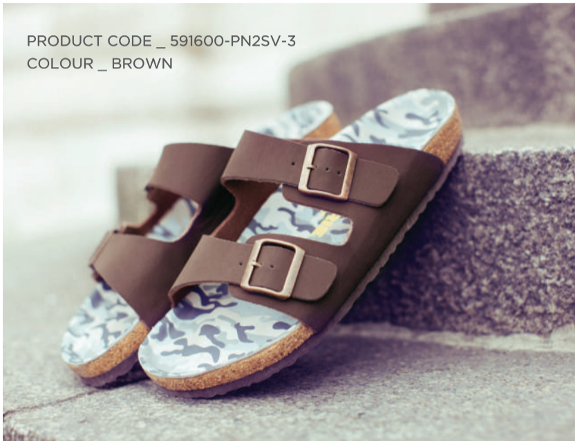
PRODUCT CODE _ 591600-PN2SV-3 COLOUR _ BROWN