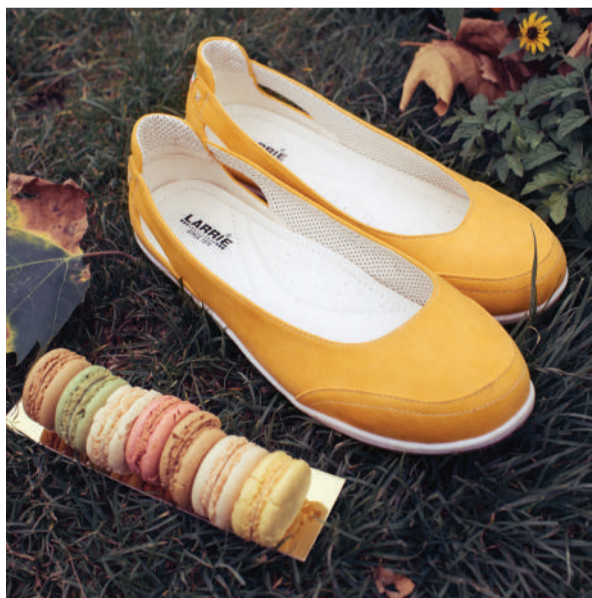
PRODUCT CODE _ L51408-AN018V | COLOUR _ YELLOW