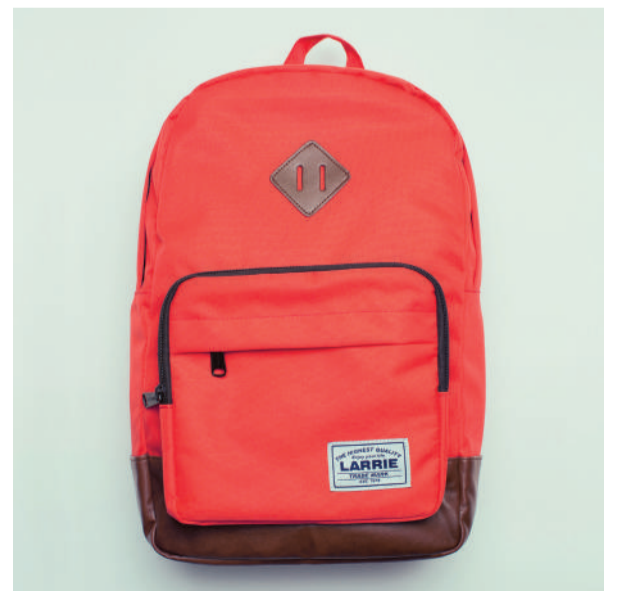
PRODUCT CODE_ LSBP11437-DFISV-2 | COLOUR_ RED