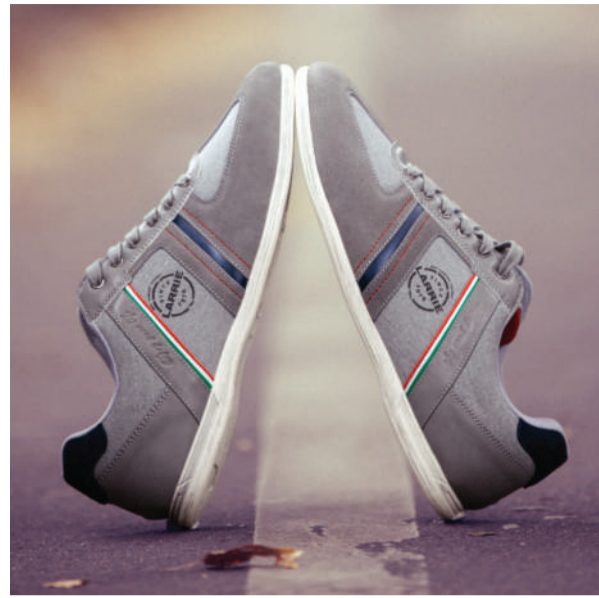
PRODUCT CODE _ 581602-GR2SV-13 | COLOUR _ DARK GREY