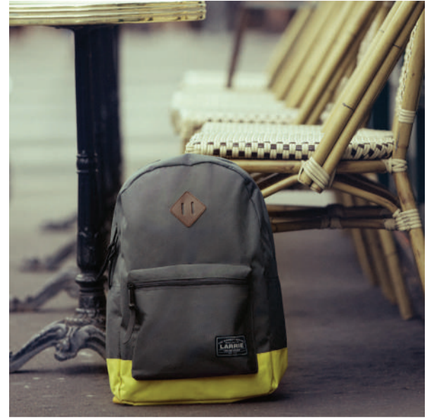
PRODUCT CODE_ LSBP11435-DFISV-12 | COLOUR_ GREY