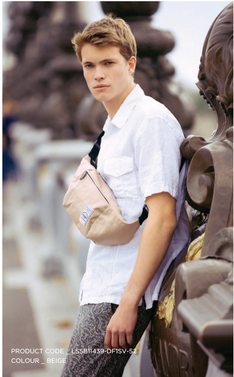
PRODUCT CODE _ LSSB11439-DF1SV-52 COLOUR _ BEIGE