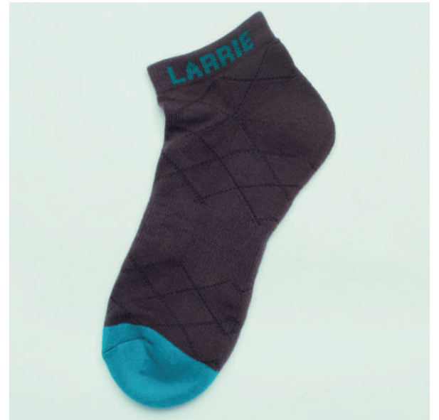
PRODUCT CODE_ L2116-A | COLOUR_ CHARCOAL