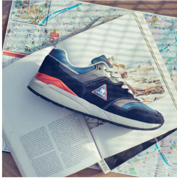
PRODUCT CODE_ 581601-GRISV-45 | COLOUR_ DARK NAVY