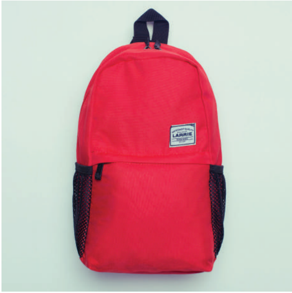
PRODUCT CODE_ LSCB11445-CTISV-2 | COLOUR_RED