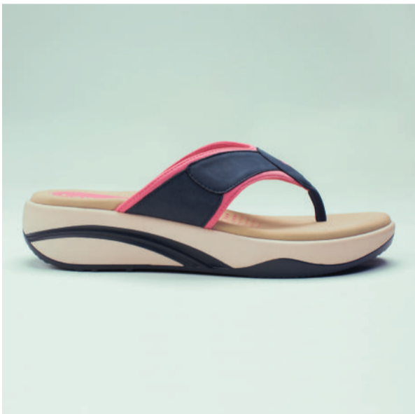
PRODUCT CODE_ L81509-CV01SV | COLOUR_ NAVY