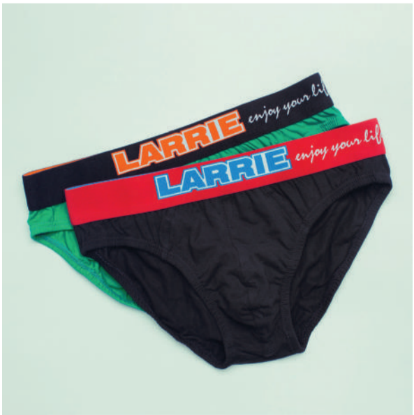
PRODUCT CODE_ LB115-3 | COLOUR_GREEN & BLACK