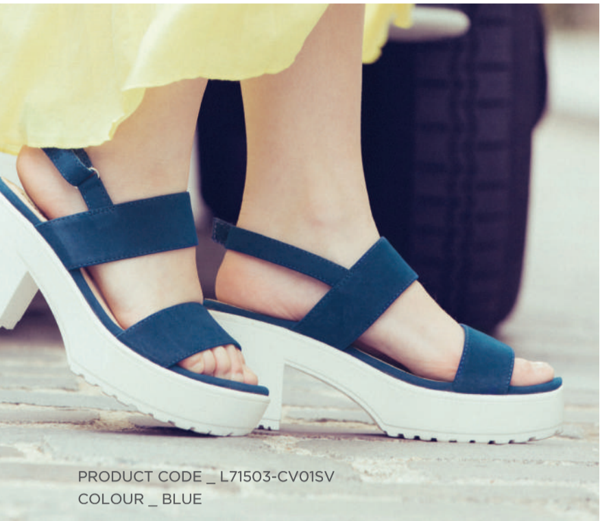
PRODUCT CODE _ L71503-CV01SV COLOUR _ BLUE