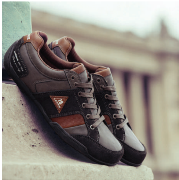
PRODUCT CODE_ 581600-GR1SV-12 | COLOUR_GREY