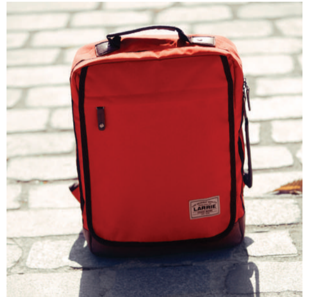
PRODUCT CODE_ LSBP11429-DFISV-2 | COLOUR_ RED