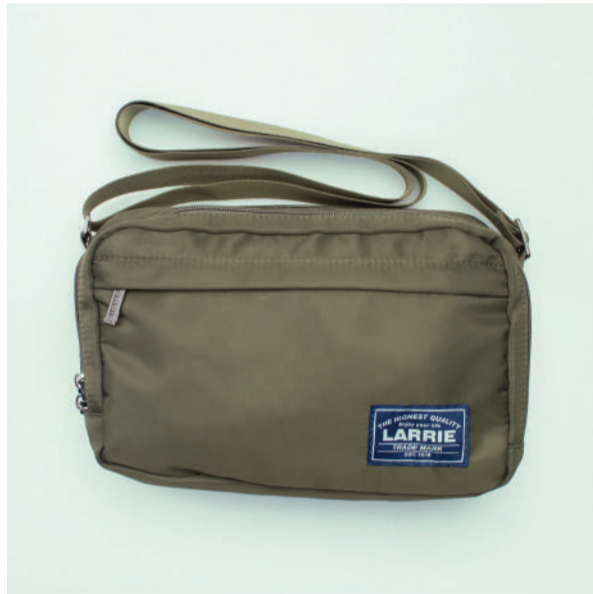
PRODUCT CODE_ LSSB11440-DFISV-7 | COLOUR_OLIVE