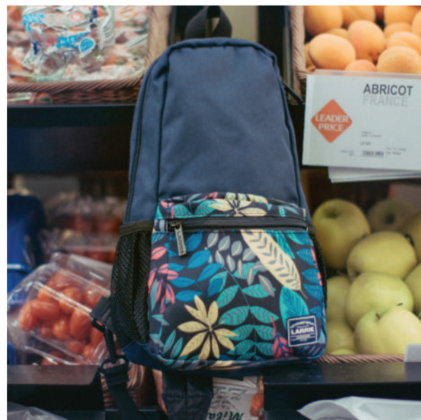
PRODUCT CODE _ LSCB11445-CT2SV-43 | COLOUR _ NAVY