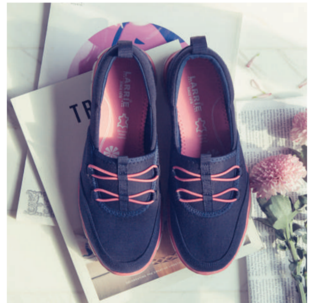
PRODUCT CODE_ L61507-KN02SV | COLOUR_ NAVY