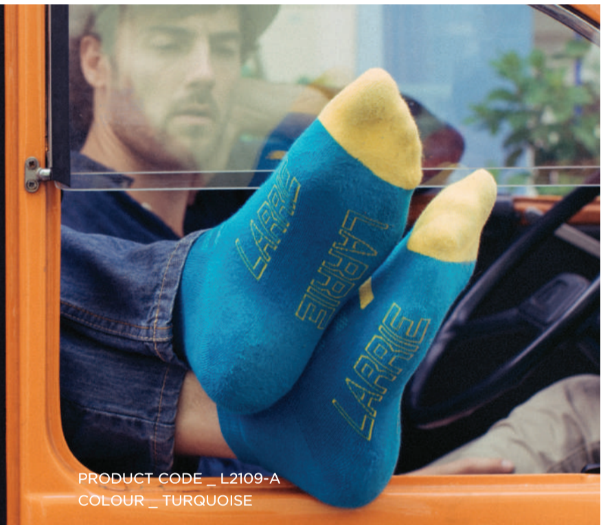
PRODUCT CODE _ L2109-A COLOUR _ TURQUOISE