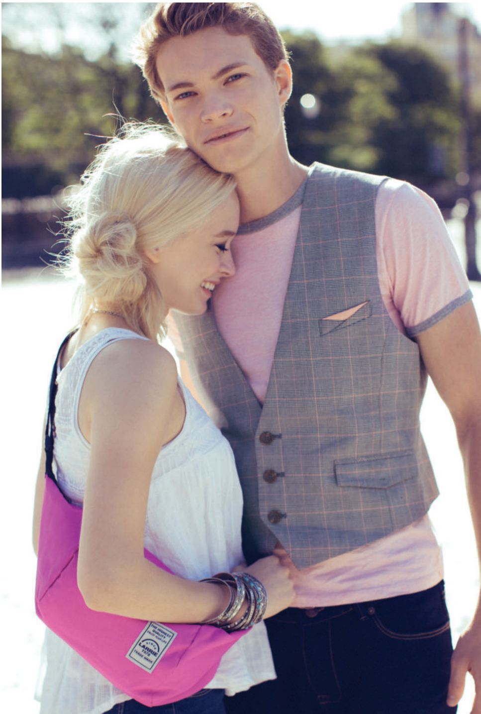
PRODUCT CODE _ LSSB11439-DF1SV-26 COLOUR _ PINK