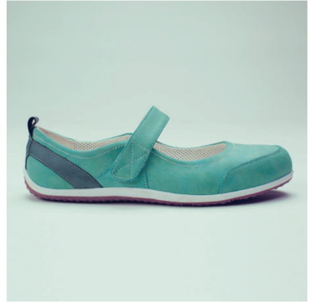
PRODUCT CODE_ L51408-AN03SV | COLOUR_ AQUA