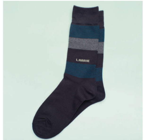
PRODUCT CODE_ L2113-C | COLOUR_CHARCOAL