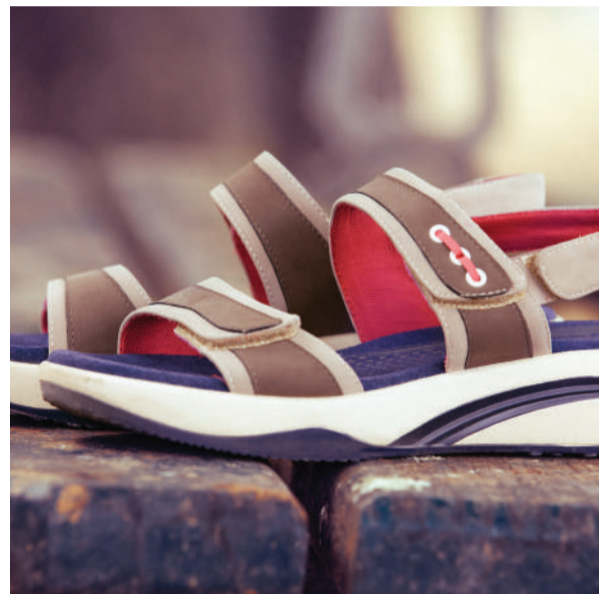
PRODUCT CODE _ L81509-CV02SV | COLOUR _ GREY