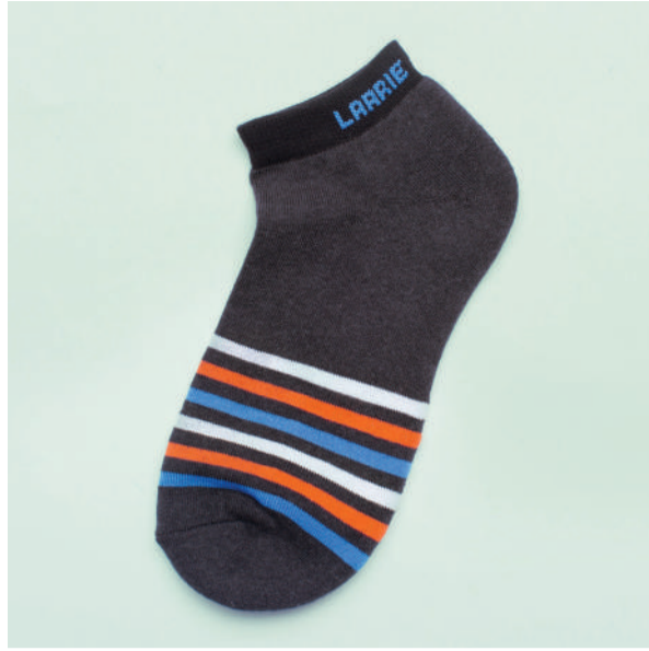
PRODUCT CODE_ L6014 | COLOUR_MELANGE GREY