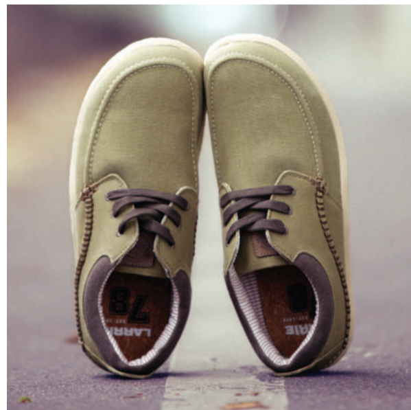
PRODUCT CODE _ 561600-FC2SV-6 | COLOUR _ KHAKI