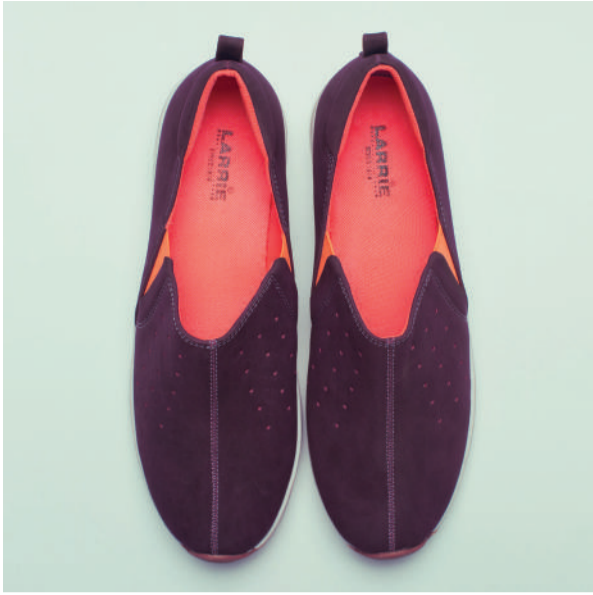
PRODUCT CODE_ L61506-WS01SV | COLOUR_ PURPLE