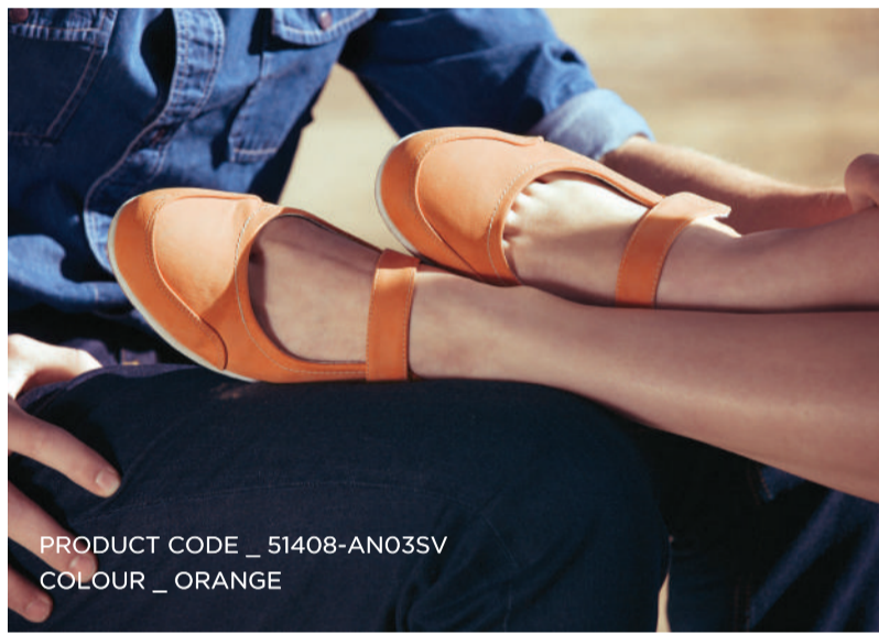
PRODUCT CODE _ 51408-AN03SV COLOUR _ ORANGE