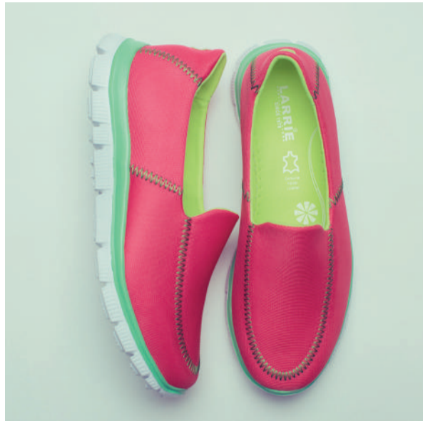
PRODUCT CODE_ L61507-KN01SV | COLOUR_ FUCHSIA