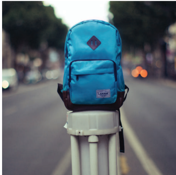
PRODUCT CODE_ LSBP11437-DFISV-4 | COLOUR_ BLUE