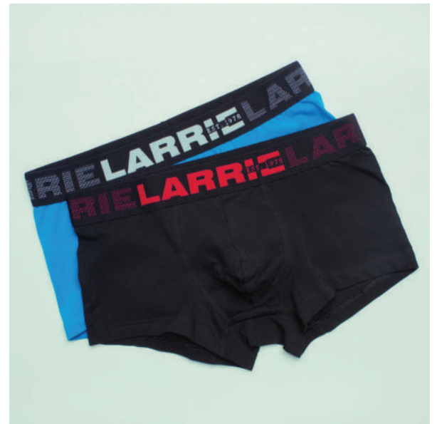
PRODUCT CODE_ LB511-2 | COLOUR_BLUE & BLACK