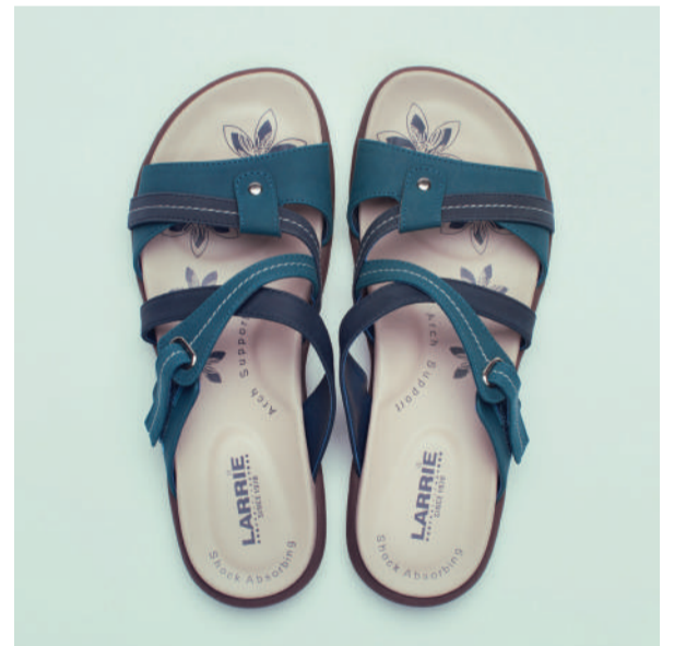
PRODUCT CODE_ L91501-CV01 | COLOUR_ BLUE