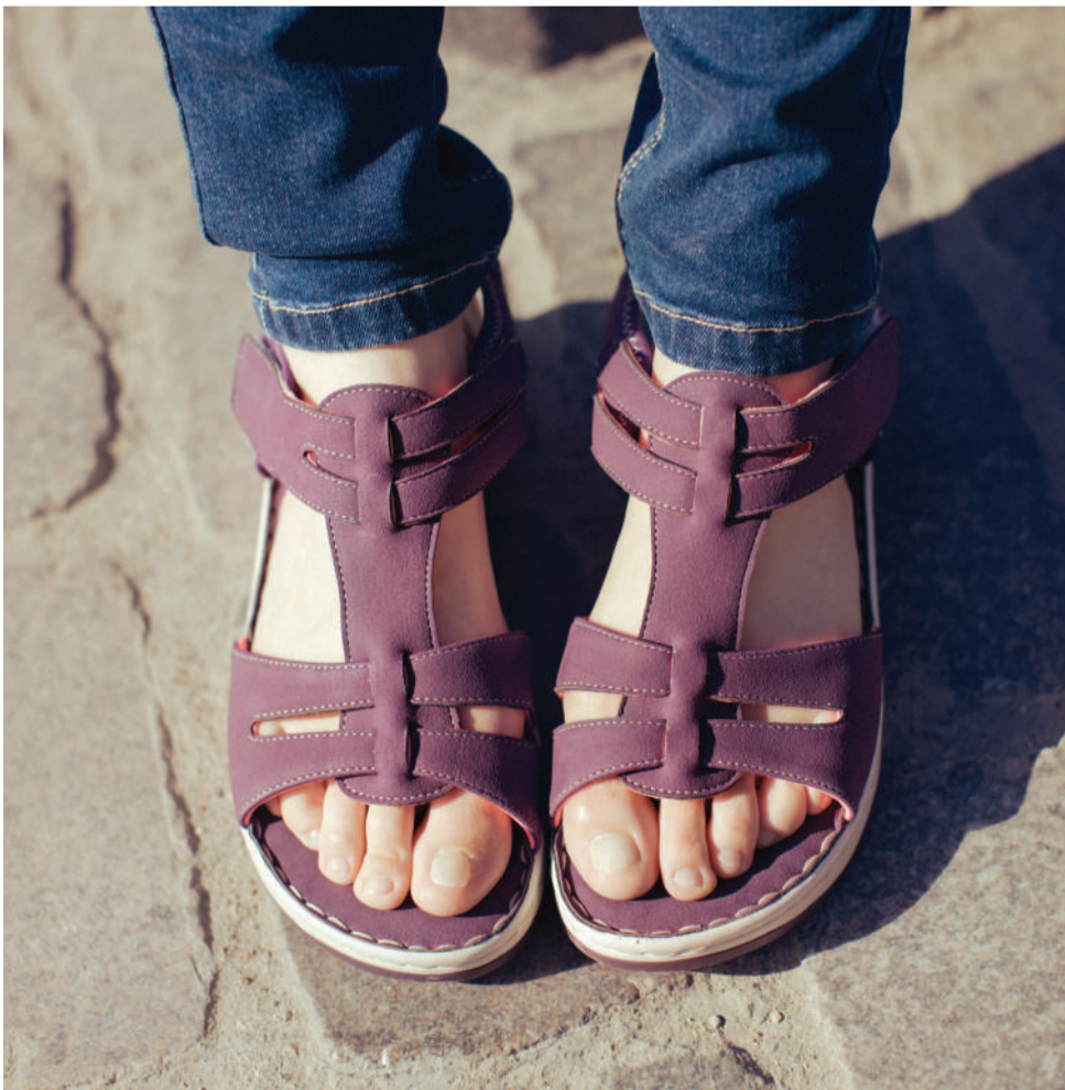
PRODUCT CODE _ L81510-ES028V COLOUR _ PURPLE