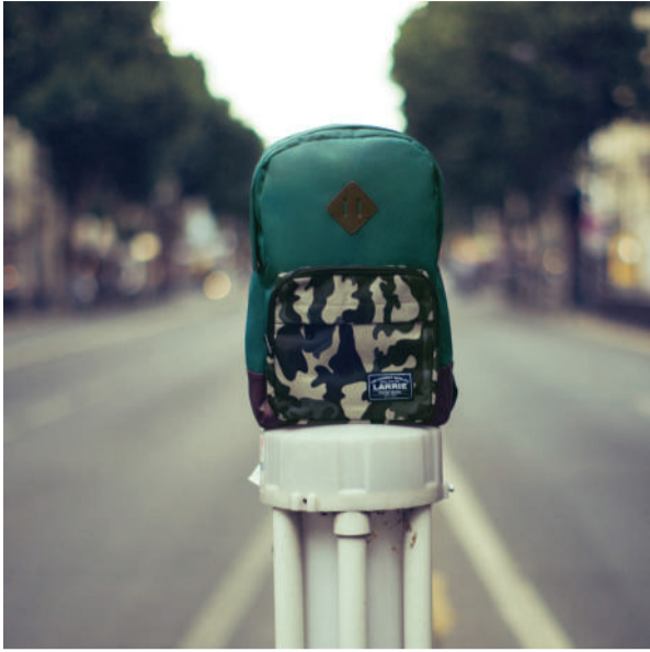
PRODUCT CODE_ LSBP11437-DFISV | COLOUR_ DRAK GREEN