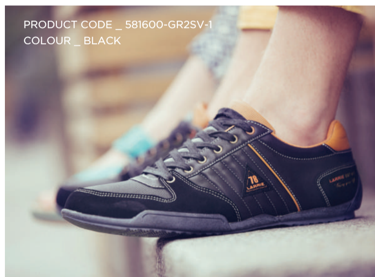
PRODUCT CODE _ 581600-GR2SV-1 COLOUR _ BLACK

Walking through the city is the best way to discover why Paris is one of the world's most romantic destinations. Bright coloured and convenient slip-ons and casual sneakers from the new Larrie Collection are truly perfect for city exploring. When seeing the city on foot, every step matters. These casual styles are best matched with Larrie's new backpack collection.