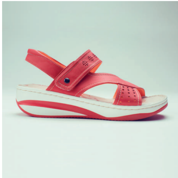
PRODUCT CODE_ LS1504-ES01SV | COLOUR_RED