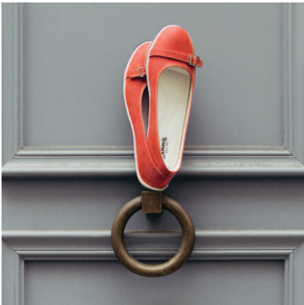
PRODUCT CODE_ L51408-AN02SV | COLOUR_ RED