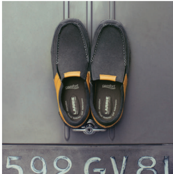
PRODUCT CODE_ 571600-FCISV-13 | COLOUR_ DARK GREY