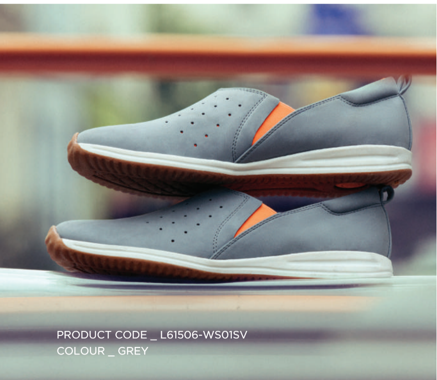
PRODUCT CODE _ L61506-WS01SV COLOUR _ GREY