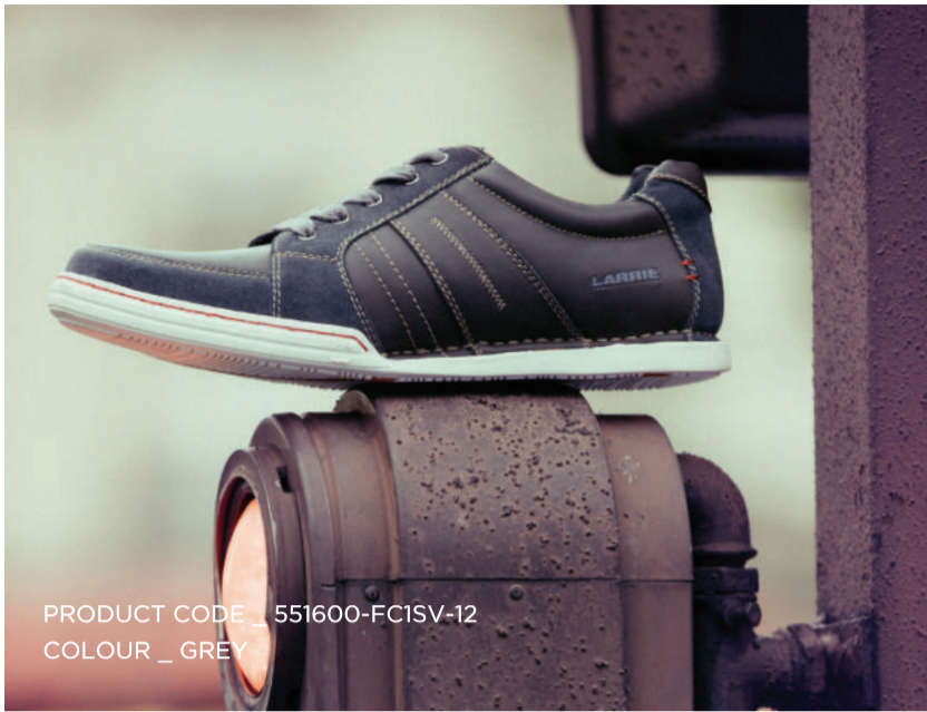
PRODUCT CODE _ 551600-FC1SV-12 COLOUR _ GREY