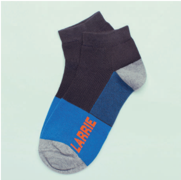
PRODUCT CODE_ L2111-A | COLOUR_ BLACK