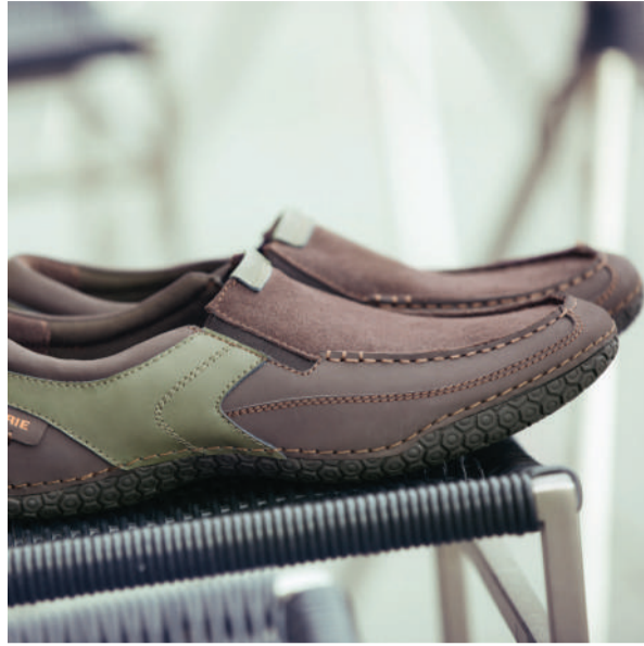
PRODUCT CODE_ 571600-FCISV-32 | COLOUR_ DARK BROWN