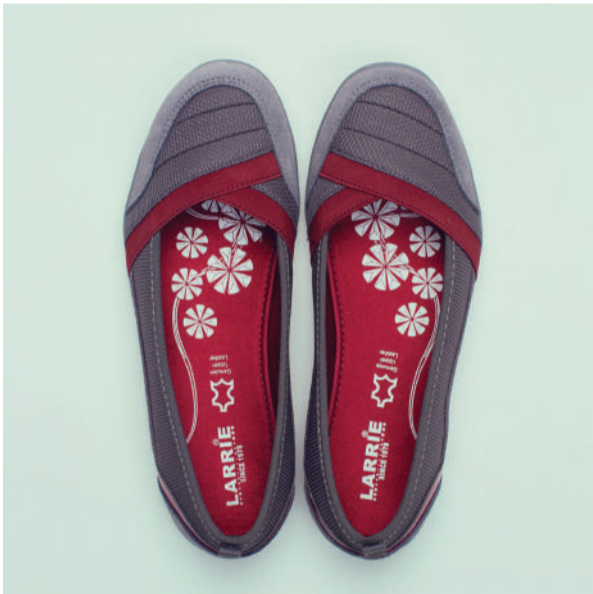
PRODUCT CODE_ L61501-KN02 | COLOUR_GREY