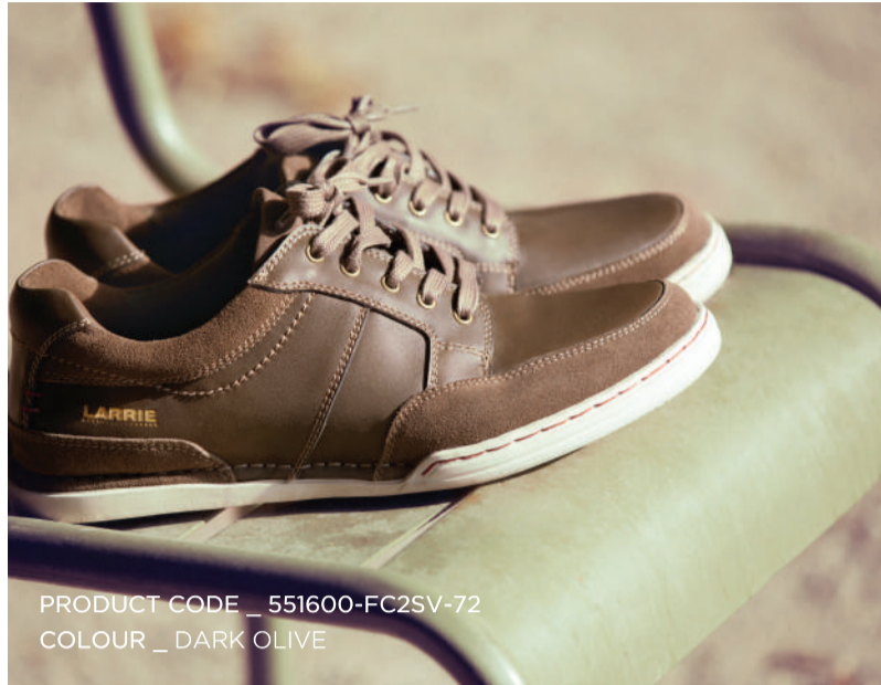
PRODUCT CODE _ 551600-FC2SV-72 COLOUR _ DARK OLIVE