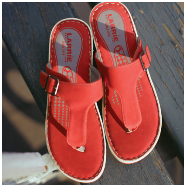
PRODUCT CODE _ L81510-ES01SV | COLOUR _ RED