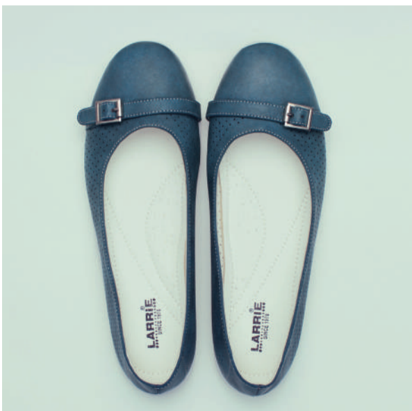
PRODUCT CODE_ L51408-AN028V | COLOUR_ BLUE